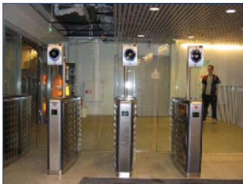
Main Entry to the Gym

When they looked at Iris Recognition they realised this was the ideal solution for their requirements. Due to the way the technology works, they could perform true identification on thousands of members extremely quickly. As it is totally non contact, Iris Recognition is hygienic and not affected by members using the gym or swimming pools.