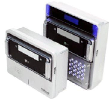
LG IrisAccess Cameras

They looked at a number of non-biometrics systems, however each one was not suited to this application. They couldn't use pin numbers, as these could be passed on, as could cards or tokens, which may also have been lost while swimming or affected by the water. They also looked at other biometrics, however due to the number of members they had, and the fact they needed true identification, these were not an option.